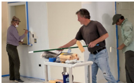
Donors, clockwise from above: Painting crew, nursery rhymes, kindergartners, Threshold Weavers, dishwasher in action.